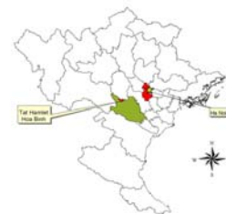
Location map of the research site Tat Hamlet, Hoa Binh province, NW Vietnam.