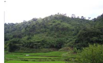
View of the research area with paddy fields in the foreground and swidden agriculture in the background, Tat Hamlet, Hoa Binh province, NW Vietnam.