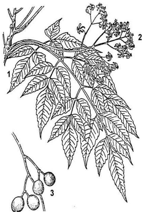
Figure 63-2. Melia azedarach Linn

After the shells crack, the nuts are promptly sown. Sowing is avoided if the nuts are already showing sprouts, because the sprouts can easily be broken and will not withstand dryness. Some farmers, usually those with enough labor, hoe the surface of the soil before sowing.