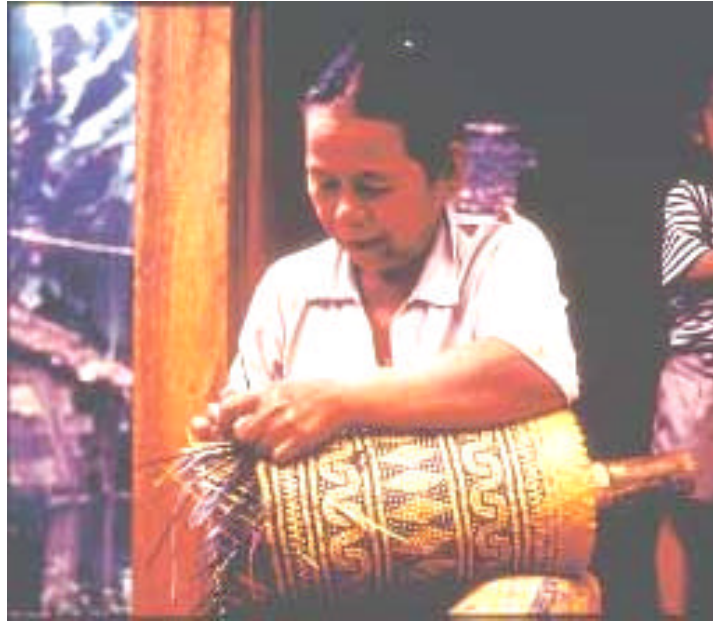
Figure1. Woman weaving rattan baskets, East Kalimantan, Indonesia

In local settings, small-scale enterprises, which are often also home-based, can be found. However, this kind of industry is characterized by its non-continuous (or seasonal) activity. Home-based industry mainly operates during the low agricultural season for making additional income. Unless the activity yields greater economic benefits in comparison to agriculture it will not be the main source of livelihood to rural people. Another problem is the absence of established markets. Most rural communities have little access to market and they are usually highly dependent upon retailers who have better connections with urban areas. The development of small-scale enterprises is even more problematic due to the fact that rural communities lack capital to enhance their production capacity.